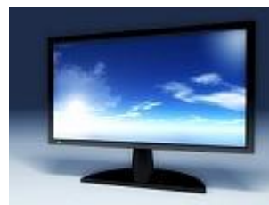
Fig. 3 Example of an image with acceptable resolution