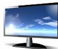
Fig. 2 Example of an unacceptable low-resolution image

Figures must be numbered using Arabic numerals. Figure captions must be in 8 pt Regular font. Captions of a single line (e.g. Fig. 2) must be centered whereas multi-line captions must be justified (e.g. Fig. 1). Captions with figure numbers must be placed after their associated figures, as shown in Fig. 1.